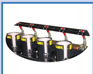
MG5-M Large handle

The PromaMug MG-5M is a manual heat press with 5 stations for standard mugs of 8-9 cm diameter or cylindrical items of similar sizes. Designed for the high-scale production at a minimum cost, it is equipped with 5 electronic boards managing each resistance at once and guaranteeing a homogeneous heating. A control button launches the count down on all the switched stations. This heat press can work at 1, 2... or 5 stations simultaneously. One big handle allows closing all the stations at once.